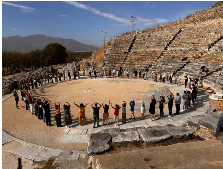
Learning about Ancient Greece on an Erasmus trip: performing an anti-bullying play in an amphitheatre in Serres.

In EYFS the focus of Knowledge and Understanding of the World is for children to discover the world around them and develop their understanding of how other people are different from them. They are supported to develop a sense of the past through stories, artefacts and exciting provocations.