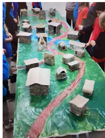
Year 5/6 invited parents in to share their Anglo Saxon village