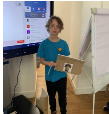
Following our own inquiry: Sharing our home learning projects following our Roman topic LKS2