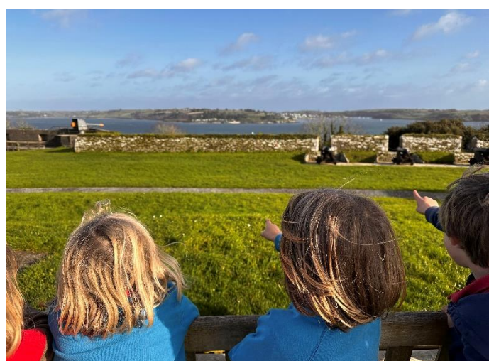
KS1 and YrR visit to Pendennis Castle