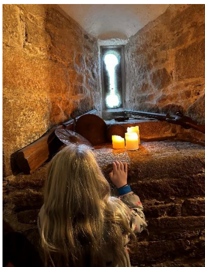
Yr2 visit to local Pengersick Castle