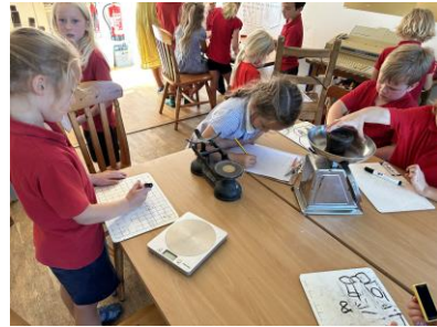
Using artefacts to provoke interest "How has Technology changed our lives over the last 60 years" KS1