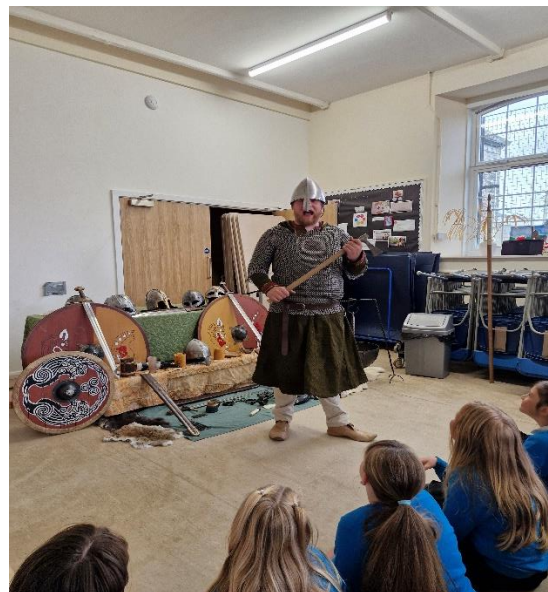
Viking Wow Day