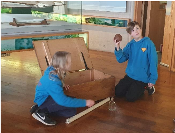
Pirate workshop National Maritime Museum

Yr 4 "I had fun at the museum. The things were old and it was smelly. It made me think I was in the olden days"