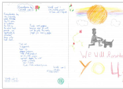
Year 5/6 reflection of remembrance day

Yr R/1/2 children learning about the history of toys were encouraged to speak to an elderly relative and ask them lots of questions about the toys they played with when they were 5/6/7 years old, including asking about materials, technology and when/ how they got new toys.