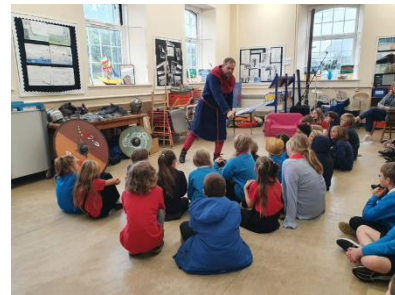
History re-enactment -Viking Wow day years 5/6