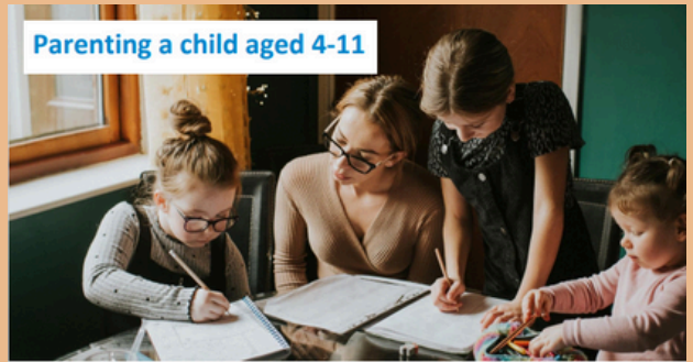
Parenting a child aged 4-11

For more information https://www.gov.uk/tax-free-childcare